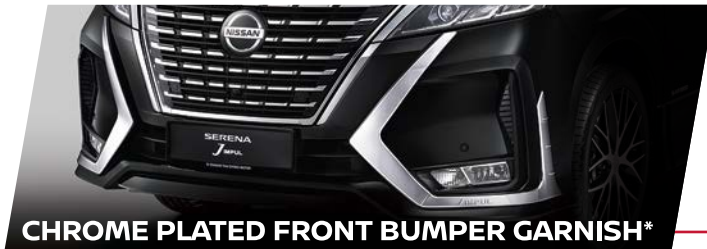
CHROME PLATED FRONT BUMPER GARNISH*