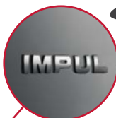
IMPUL IMPUL EMBLEM