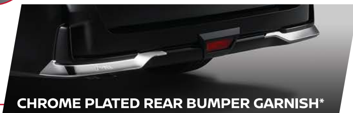
CHROME PLATED REAR BUMPER GARNISH*

Created with high precision 3 dimensional data via injection moulding.