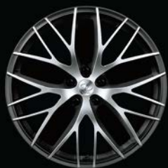
18" IMPUL MILLENNIUM ALLOY WHEELS* IN BLACK AND POLISHED FINISH